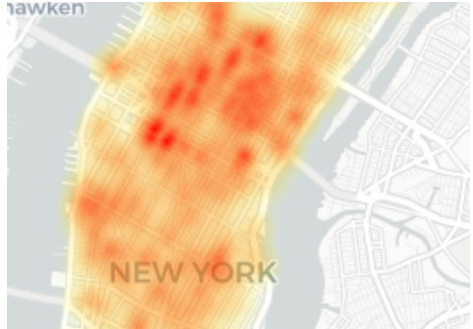
Fig. 1: A cropped view of the initial distribution of capacity four vehicles needed to service all of the taxi demand in Manhattan for a given day

Ride-sharing, where more than one passenger is able to use the same vehicle at the same time, is improving the efficiency of vehicle fleets by allowing less vehicles to service more requests. Services such as UberPool and Lyft Line have demonstrated how effective ride-sharing can be at extending our means of transportation within a city. Global vehicle dispatching algorithms have been developed that make use of ride-sharing by considering batches of requests, and optimizing routes for a set of vehicles to service these requests. These algorithms can ensure that passengers do not need to wait too long to be picked up and that by sharing